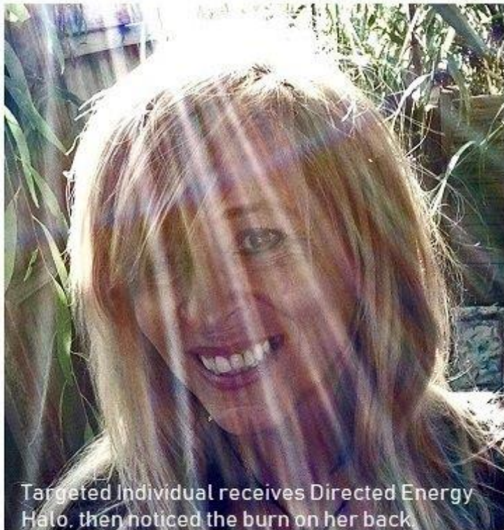
Targeted Individual receives Directed Energy Halo, then noticed the burn on her back.

Note the halo around her head – energy from the sky